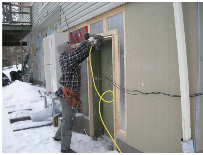
(Now that our Go Green Grant project has ended, a toonie donation for the Hall is appreciated.)